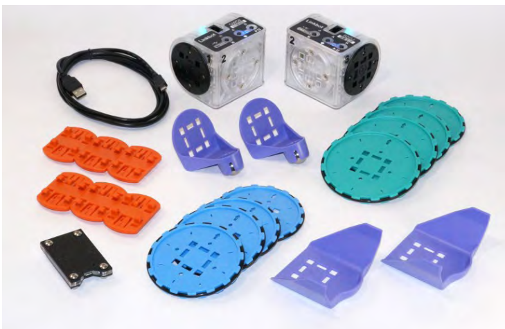
C-STEM Getting Started Bundle